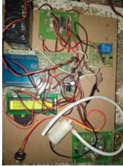
Fig.2. Hardware circuit.

This project comes with an application called “Smart Home”. This app controls the various appliances connected to our Arduino and also relays. When we on the toggle buttons the application are pressed, corresponding Bluetooth signals are sent from our Android phone to the Bluetooth module. Here five relays are connected with Arduino. The Arduino finds the signal which was sent and compares it to the predefined signals allocated for each appliances. When it identifies that signal, the Arduino activates the relay hooked up to its digital pin. It passes 5V through it. Thus the relay is switched ON and the corresponding appliance connected to the relay is turned ON. On the other hand, to OFF the switch, Arduino passes a 0V or logic low to the digital pin.