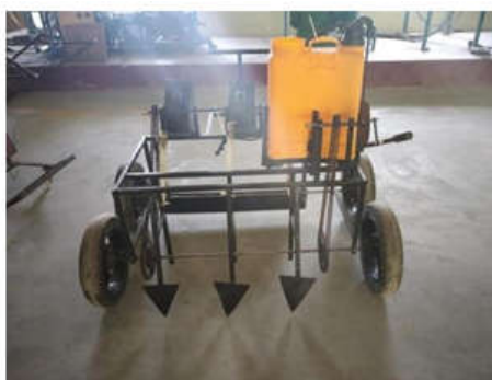
Fig.3: Fabricated agriculture machine

This machine is manually operated and the energy used to operate this machine is converted into the desired work. On pushing the machine, the ploughing rods get in contact with the surface of the agriculture land and it ploughs the land. When this process takes place, simultaneously the chain drive makes the seed sowing unit to function and the seeds are loaded into the mini conveyers and then pushed into the rods which then finally fall on the ploughed field. The leveler then covers the seeds and then pushes away excess soil and unwanted stuff off the field. Finally, with the help of a crank mechanism, water is sprayed. The added advantage is that multiple seeds can be sown at the same time which makes the tiring work simpler and more economical.