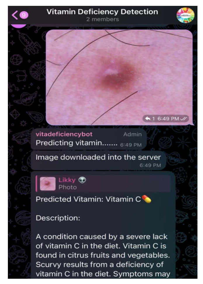
Fig.4 Example Output 1

In summary, our investigation is a vital step forward within the application of manufactured intelligence in healthcare, particularly within the field of restorative picture examination. By presenting inventive approaches to the location of vitamin insufficiencies, we point to advance early conclusions and compelling treatment techniques. Our demonstrated guarantees to back healthcare experts to move forward understanding results through opportune intercession and personalized treatment plans, eventually making strides in the quality of care in clinical practice.