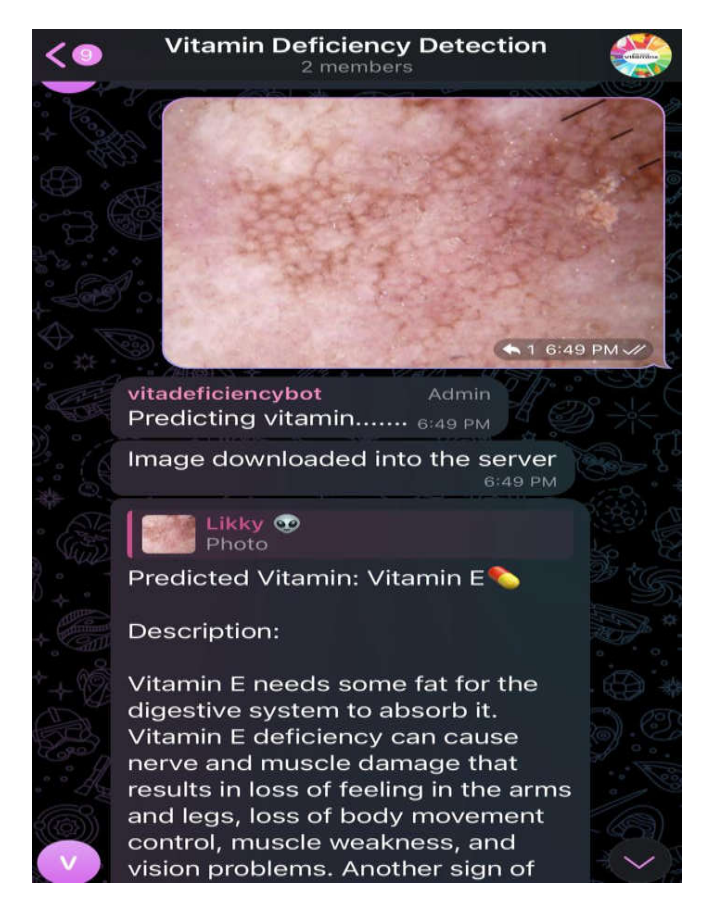
Fig.5 Example Output 2